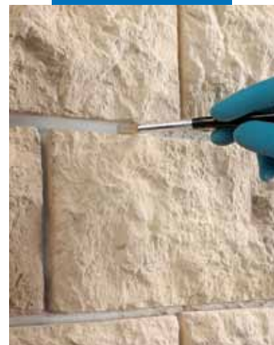
Smoothing the joints with a damp brush