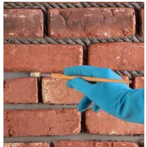
Smoothing the joints with a damp brush