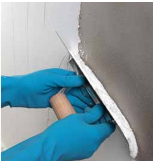
Spreading adhesive to a feather edge on the substrate