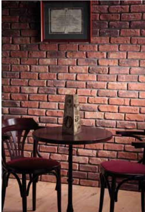
An example of laying terracotta brick slips outside