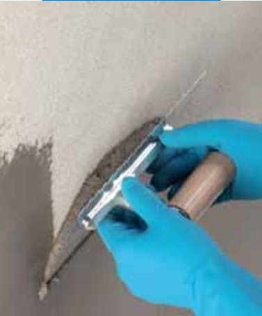
Spreading grey Fix & Grout Brick to a feather edge on the substrate