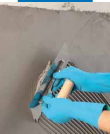
Spreading grey Fix & Grout Brick diagonally with a notched trowel