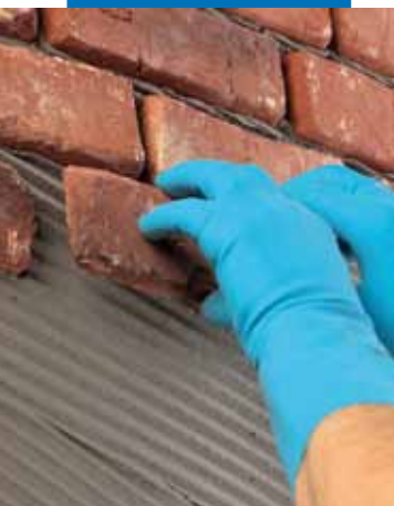
Laying terracotta slips