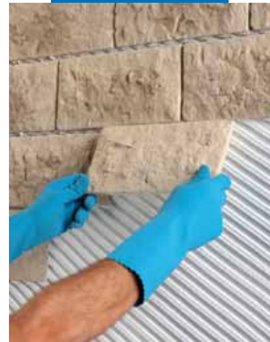
An example of laying ornamental lightweight cementitious composite slips externally