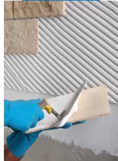
Spreading adhesive on the back of ornamental units

For further and complete information about the safe use of our product please refer to the latest version of our Material Safety Data Sheet.