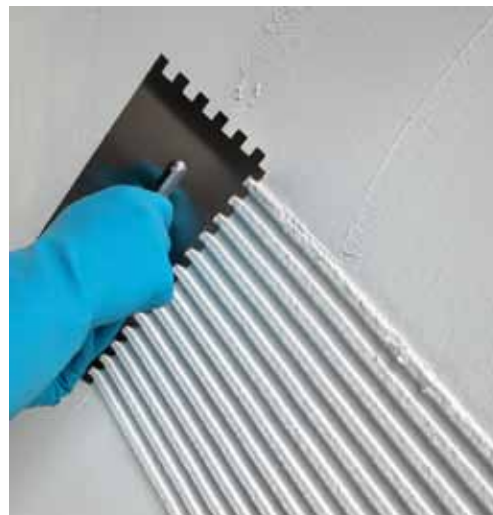
Spreading white Fix & Grout Brick diagonally with a No. 10 notched trowel