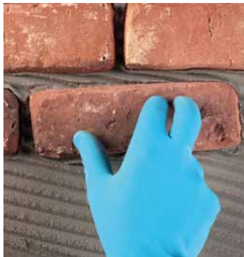
Pressing the slip into position to guarantee good buttering and filling of the joints