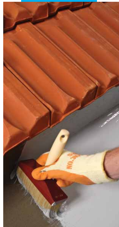
Example of a gutter waterproofed with Mapelastec Smart and coated with Elastocolor Waterproof