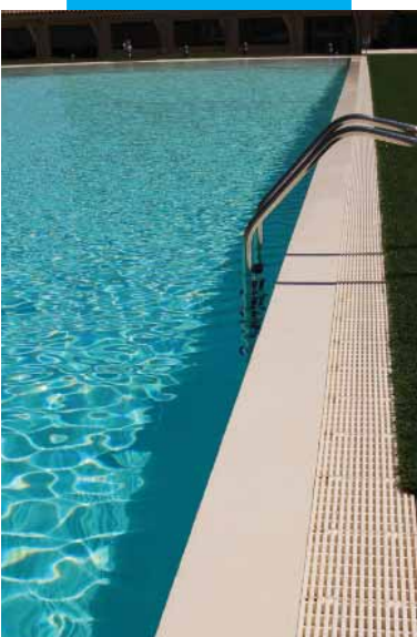
Detail view of a swimming pool dressed with Elastocolor Waterproof