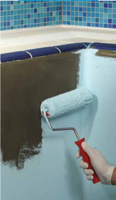
Application of Elastocolor Waterproof with a roller