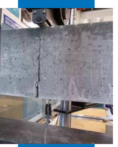
CMOD controlled bending test in compliance with EN 14651 standards