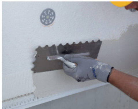
Application of the Mapetherm Driphose Bead with Mapetherm AR1 Light

Once the adhesive is completely dry, spread an even layer of Mapetherm AR1 Light on the surface and then embed Mapetherm Net alkali-resistant fibreglass mesh in the mortar. The Mapetherm Net mesh must be pressed down with a smooth trowel into the fresh layer of mortar mix and each piece must overlap by at least 10 cm along the edges. After 12-24 hours, apply a second layer of Mapetherm AR1 Light reinforcing compound to form a compact, even surface suitable for the final coating or covering, which must only be applied once the first layer is hardened and cured.