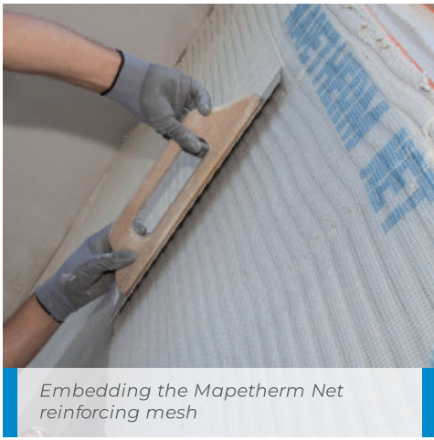
Embedding the Mapetherm Net reinforcing mesh