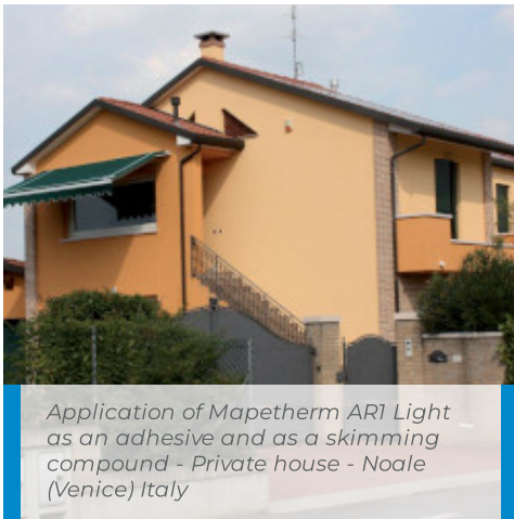
Application of Mapetherm ARI Light as an adhesive and as a skimming compound - Private house - Noale (Venice) Italy