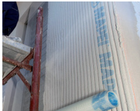
Application of Mapetherm Net into the first skimming coat