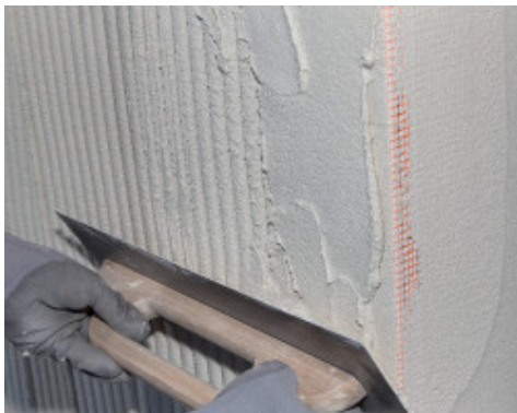
Application of the first skimming coat of Mapetherm AR1 Light