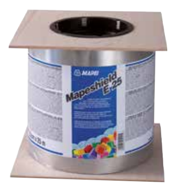
Roll of Mapeshield E 25