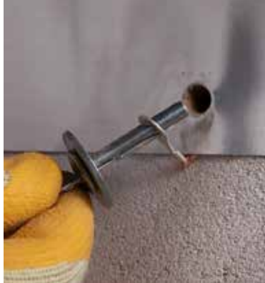
Connecting the electric cable to Mapeshield E 25 with a fastener