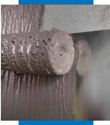
Smoothing over and protecting Mapeshield E 25 with Mapelastic Smart applied with a roller