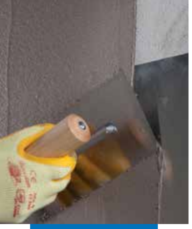
Smoothing over and protecting Mapeshield E 25 with Mapelastic applied with a trowel