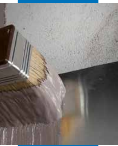
Mapelastic Smart applied with a brush