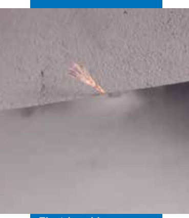
Electric cable previously connected to the reinforcement rods