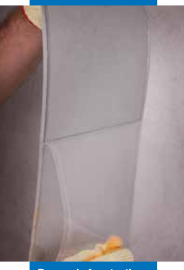
Removal of protective backing from the self-bonding gel

Do not use the product if water percolates inside the structure. In such cases, use Mapeshield I.